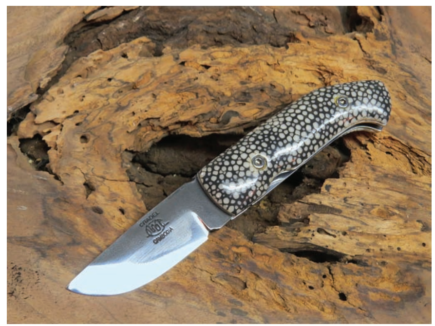
The Saigon is a compact, classy EDC folder that blends modern European steel with classic Far East handle materials.