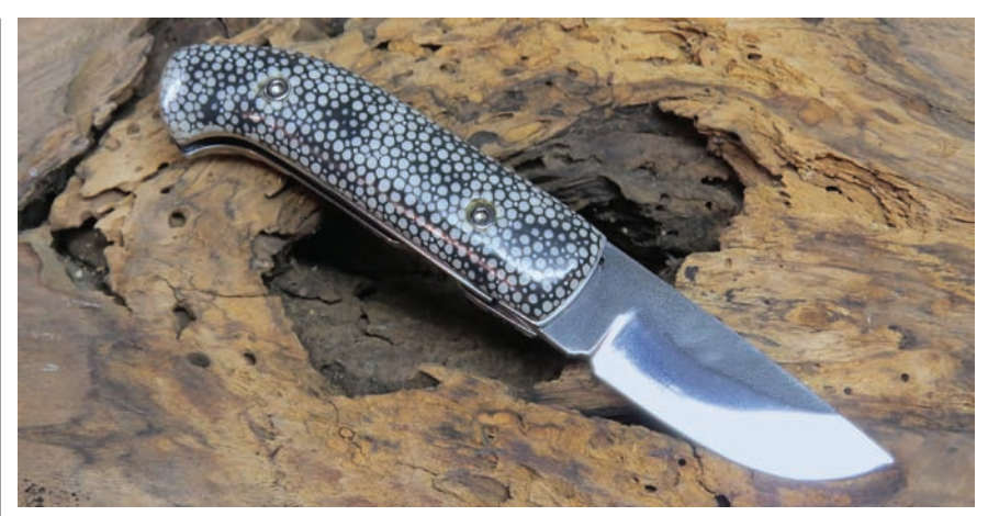
The Saigon uses handle scales of polished rayskin that make for an extremely unique and striking appearance.

"THE KUKRI'S BIG HANDLE MAKES IT VERY COMFORTABLE TO USE AND THE RECURVE BLADE IS CAPABLE OF MAKING POWERFUL CUTS..."