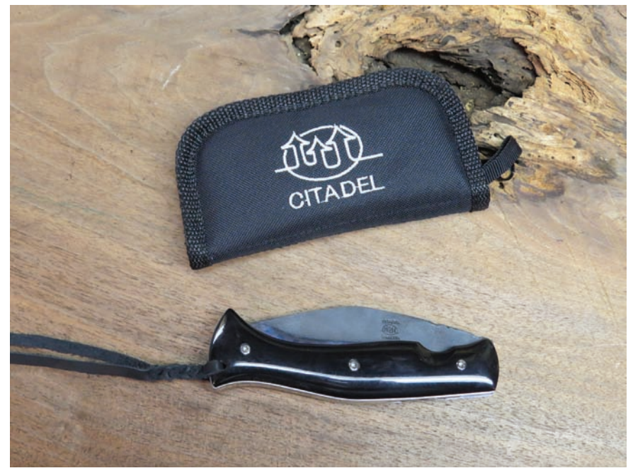
Citadel folders come with padded nylon pouches just like many custom knives.

When I opened the box from CAS Iberia the first thing I noted was that both knives came in sturdy, padded, zippered nylon carry cases—a nice touch right out of the gate and one I usually only see with custom knives. Unzipping the cases revealed the pocket-sized Saigon with its distinc-