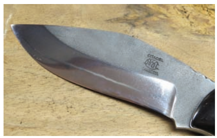
The Kukri Lock's handle is very similar to the author's buffalo horn handled kukri from World War II.

The Kukri Lock mostly got carried when I was dressed casually in jeans or cargo pants. It's pretty heavy to just drop in your front pocket but it worked well tucked in my back pocket alongside my wallet. I've given some thought to having an opentop leather belt pouch made for the Kukri and think that might be just the ticket for regular carry.