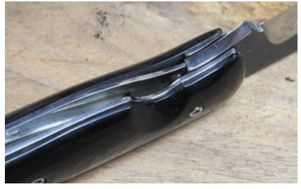
The Kukri Lock uses a recurve blade similar in style to a full-sized kukri.

Regardless of how you carry it, the Kukri is a real performer when you start using it. The big handle makes it very comfortable to use and the recurve blade is capable of making powerful cuts. I can see this knife being a great outdoors blade, especially in areas where a fix bladed knife might be prohibited. The lock-up is extremely positive and while I didn't try any chopping with it, I did run it through some basic camp and bushcraft chores such as cutting poles for a cooking tripod, sharpening stakes and prepping tinder for the fire.