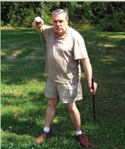
With the sword drawn, as with any sword cane or sword stick, one now has two weapons, one edged and one impact; or, one can parry with the left hand weapon while attacking with a cut or thrust with the right-hand weapon.