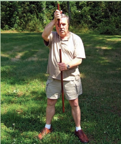
Partially opening the sword stick allows the blade to block the hand or arm of an opponent, and unexpectedly so, the opponent potentially slicing himself badly.