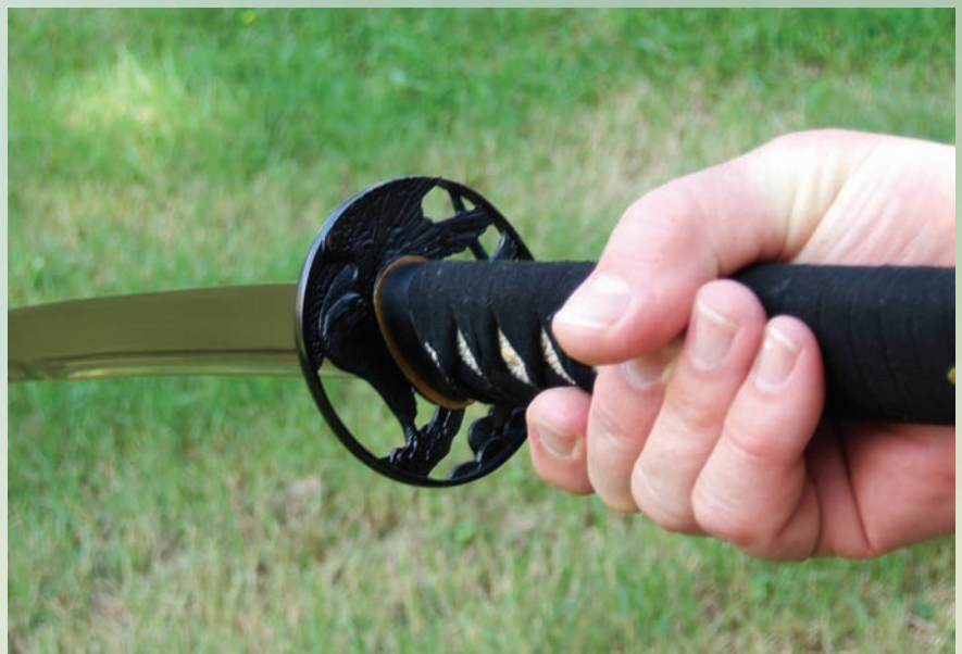
Look closely at the tsuba (guard) and you'll see the image of a cormorant, a theme repeated in this excellent cutting sword from CAS Hanwei's Raptor series.