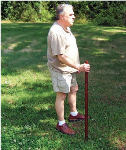
Ready for a peaceful stroll among the wonders of nature...

like and gain terrific momentum as it is raised upward. In the offensive mode, the blade will be moving quite rapidly and the weight of the sword and the hand that wields it will accelerate the speed of attack. And, of course, with the sword concealed inside a stick, quickly raising one's stick and partially separating the blade from the scabbard affords a razor-sharp implement with which to block ordinary blows.